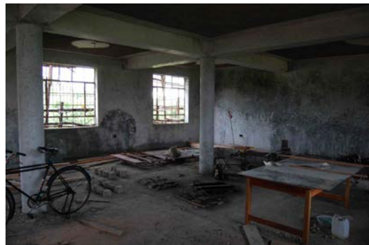
Figures 14-21 A Long Way to Go and Two Months to Do It