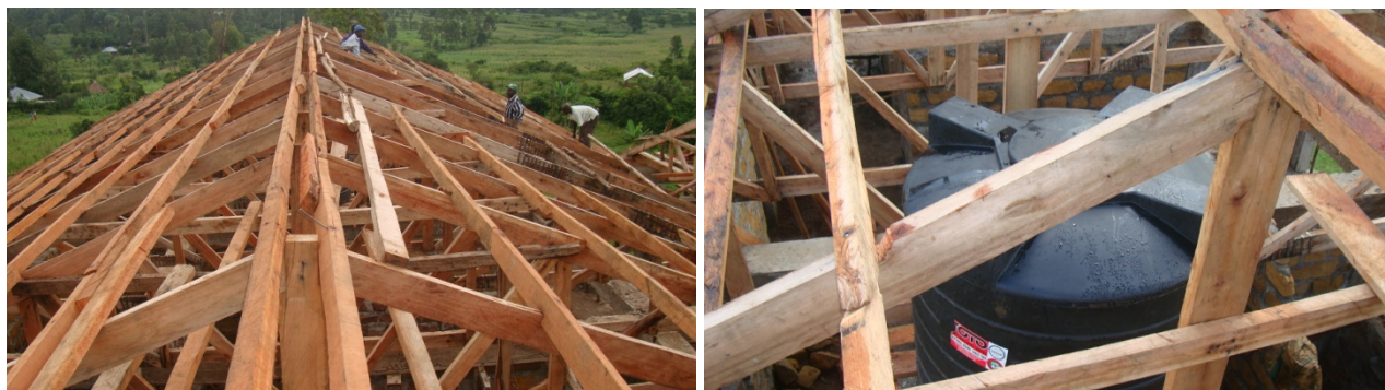
Figure 3 and 4 December 30, 2009 Roof Framing (left) Water Tank Install in Attic (right)

Just a month later in January 2010, the roof is completed and the workers begin to work on the stone work and exterior wall structures. The immediate goal is to have the dormitory ready for use for the Kenyan Deaf Prayer and Learning Workshop (KDPL) to be held at Sam's Place for the first time in June 2010. Looking at the building in January brought worries that there was too much to do, both to the exterior and the interior, to meet the deadline. Simeon Ongiri Atanga, our director and project supervisor, and our contractor worked miracles as the workers labored diligently in the months that followed. By June the dormitory was ready for the