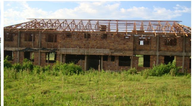
Figure 1 and 2 December 30, 2009 Front Elevation (left) Rear Elevation (right)