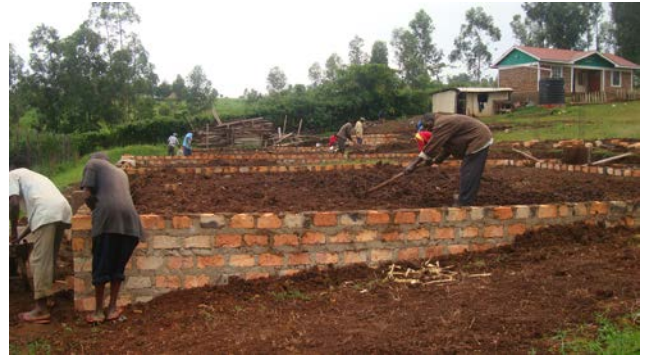
Figures 77-78 Foundation Begins (left and right) Multi-Purpose Building in Foreground Vocational Building in the Distance