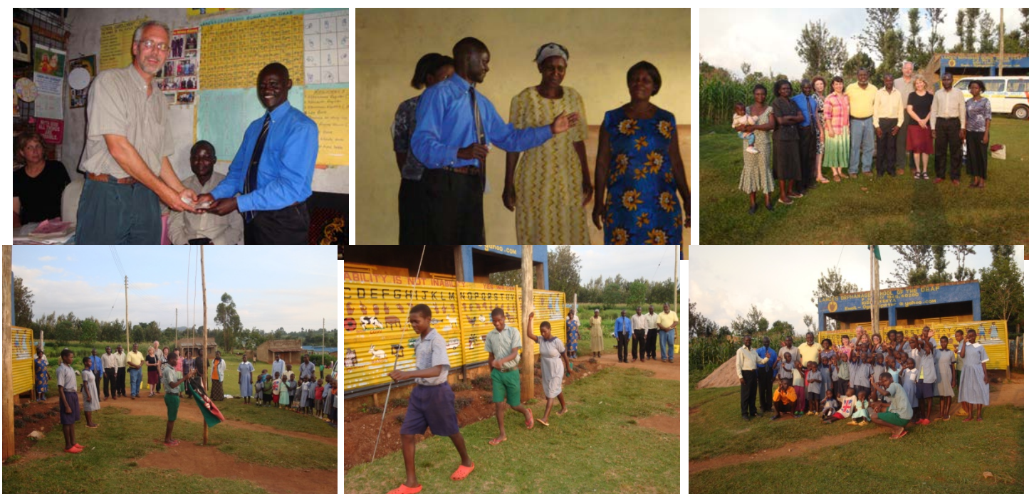
Figures 38-43 Visitto Lance Orphanage School for the Deaf