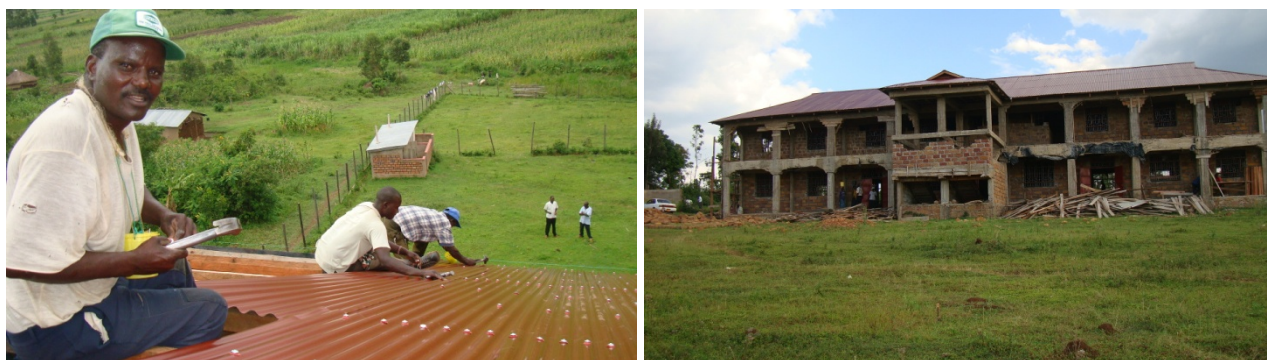
Figure 5 and 6 January 2010 Finishing the Roof (left) The Completed Roof and Scaffling Removed (right)

Just a month later in January 2010, the roof is completed and the workers begin to work on the stone work and exterior wall structures. The immediate goal is to have the dormitory ready for use for the Kenyan Deaf Prayer and Learning Workshop (KDPL) to be held at Sam's Place for the first time in June 2010. Looking at the building in January brought worries that there was too much to do, both to the exterior and the interior, to meet the deadline. Simeon Ongiri Atanga, our director and project supervisor, and our contractor worked miracles as the workers labored diligently in the months that followed. By June the dormitory was ready for the