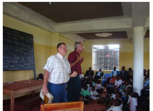
Figures 47-55 KDPL Scenes