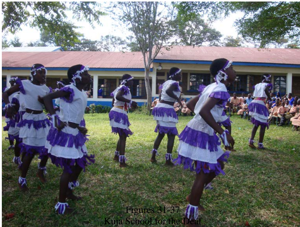
Figures 31-37 Kuja School for the Deaf