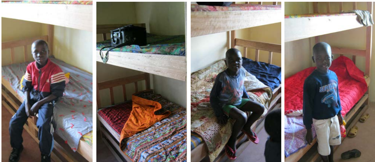
Figures 66-69 Four of the Boys Rooms Second Floor, Dormitory

The six children were assigned rooms, four beds per room. The next morning we noticed that 6 boys had slept in one bed. The beds are larger than the normally small metal cots found in most orphanages in Kenya. We asked, “Why did you all sleep together?” Their response, “We were scared.”