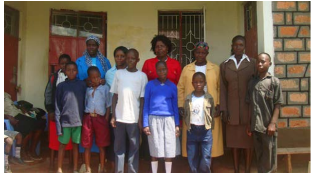
Figures 111-113 The Next Eight Orphans Arrive at the End of the Year