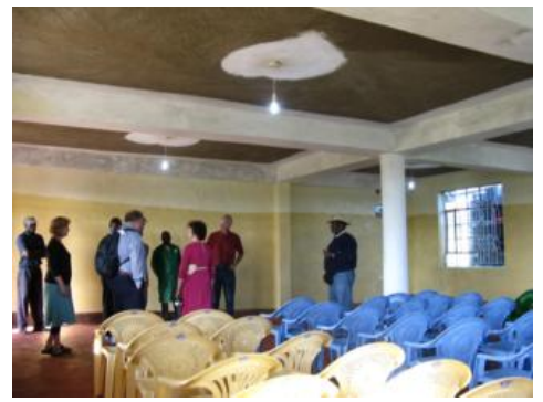
Figures 44-46 The Technology Lab Classroom and Family Room Seen for the First Time