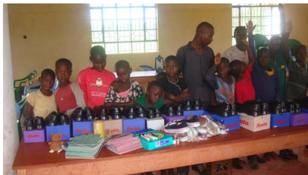
Figures 91-92 Receiving New Uniforms (Above Left) Children Receiving their New Shoes (Above Right)