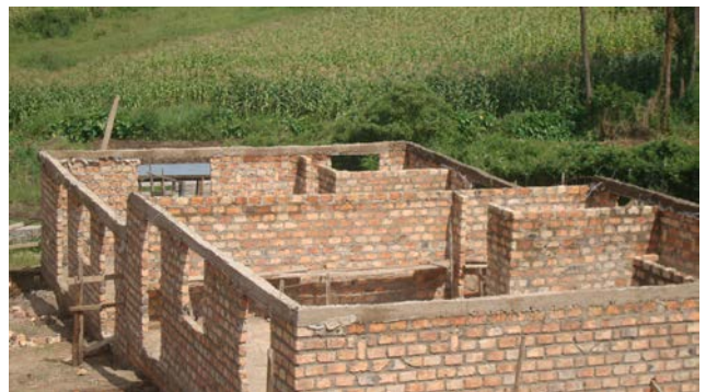
Figures 79-82 Multi-Purpose Building (Top Left, Bottom Left) Vocational Building (Top Right, Bottom Right)

The back of our property had a cow-shade (cow-shed) constructed at this time for the purpose of buying a cow. Napier grass has already been planted in that area near the creek for grazing so that a minimum of feed will need to be purchased. This will greatly cut down on the cost of milk for chai and for feeding the children.