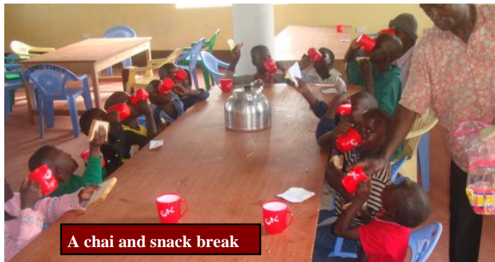
A chai and snack break